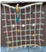
Climbing Net/Play Gym [L] $219.99

***CALL FOR SHIPPING RATE*** [Product Details...]